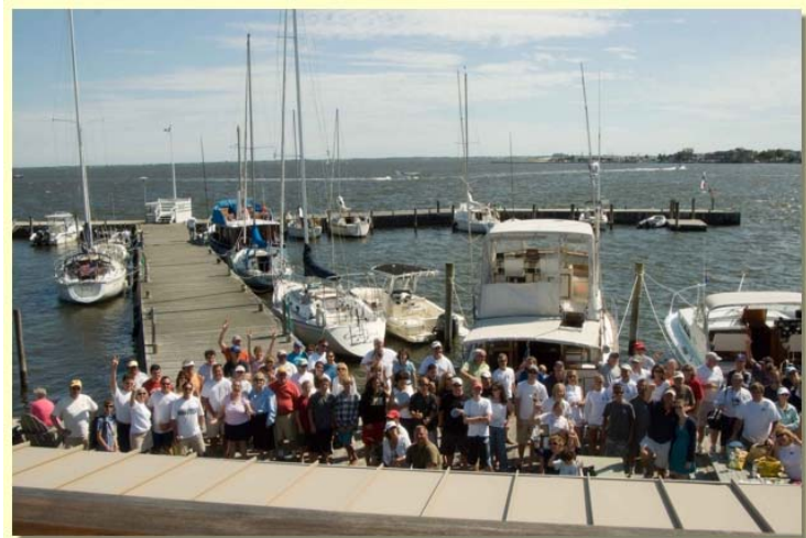
Until next year!!!