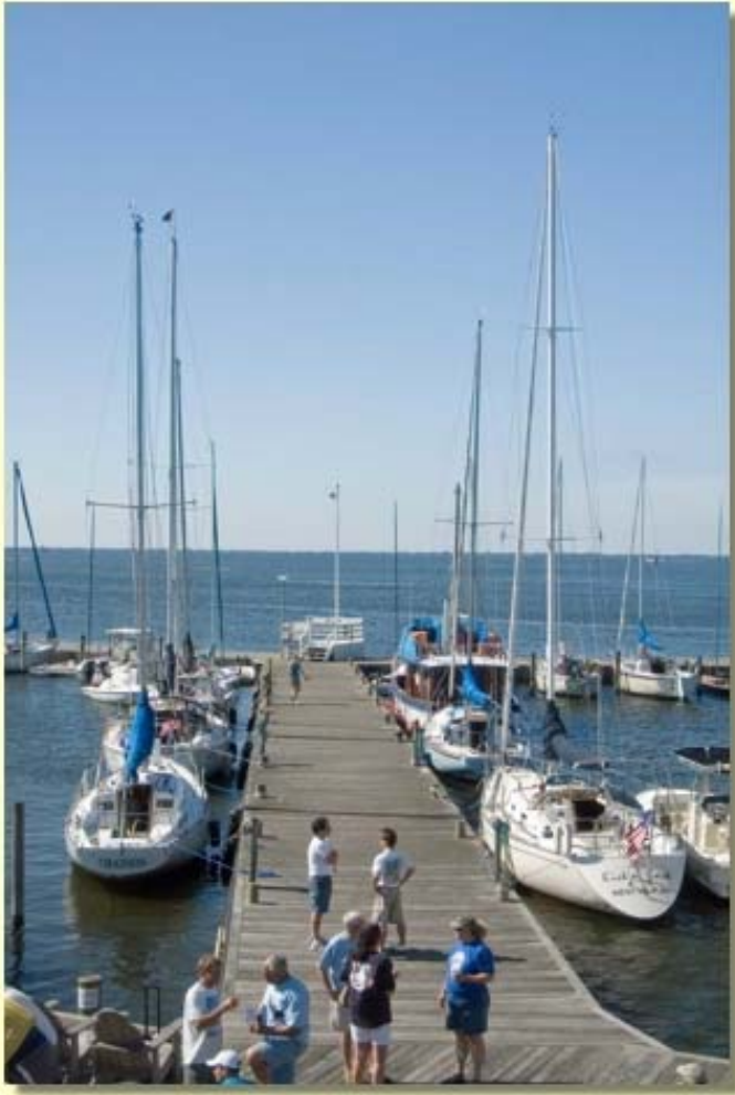
Fourth of July Regatta